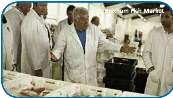
Brixham Fish Market